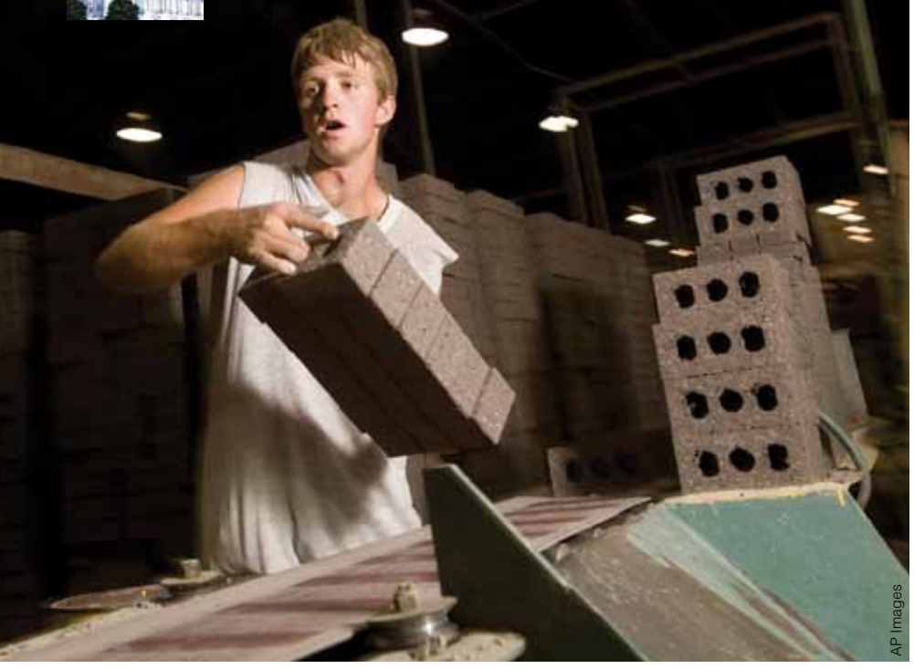
Cap-and-trade legislation, such as that passed by the House in June (see House vote #12), would negatively impact not just major utilities that emit carbon dioxide and other "greenhouse" gases, but other businesses as well, including the family-owned Belden Brick Co. (shown above) in Ohio.

O Cap and Trade. The American Clean Energy and Security Act (H.R. 2454), also known as the cap-andtrade bill, would not merely "cap" carbon dioxide and other "greenhouse" gas emissions, ostensibly to fight global warming, but would reduce the amount of allowable emissions over time - to 17 percent below 2005 levels by 2020, 42 percent by 2030, and 83 percent by 2050. The government would auction or freely distribute a limited number of emission allowances, which companies would be able to buy or sell. Of course, as the total amount of allowable emissions is reduced, the price of the allowances would skyrocket - and with them the price of electricity and whatever else is produced from burning fossil fuel. The Congressional Budget Office estimated that the effect of the House committee version of the bill would be to raise federal taxes by $846 billion and direct federal spending by $821 billion over the 2010-2019 period.