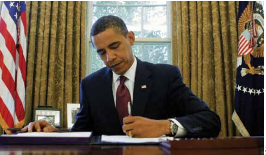
Big spender: President Obama signs the fiscal 2009 supplemental appropriations bill, which provides an additional $105.9 billion for "emergency" funds over and above the regular appropriations for the current fiscal year. (See House vote #11 and Senate vote #11.)

"nays" because the spending is over and above what the federal government had already budgeted, the United States never declared war against Iraq and Afghanistan, and some of the spending (e.g., Cash for Clunkers and foreign aid) is unconstitutional. The Senate passed this legislation two days later. (See Senate vote #11.)