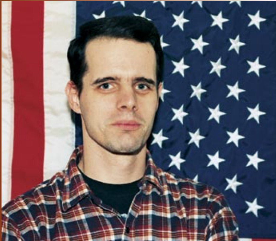
The New American