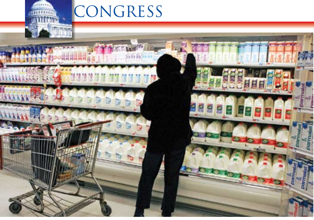
Full circle: Congress voted to send out "economic stimulus checks" partially because of inflation, which is a hidden tax caused when government creates additional money and credit that drive up the price of goods — even staples such as milk. But because government won't reduce spending and is sending out rebate money it does not have, it will now create more inflation, further driving up the cost of goods.

99 Children's Health Insurance. L J H.R. 3963, a bill to reauthorize the Children's Health Insurance Program, was rejected 260-152 on January 23, 2008 (Roll Call 22) when the House failed to get the necessary two-thirds majority of those present to override President Bush's veto. The bill would have authorized the State Children's Health Insurance Program (SCHIP) at nearly $60 billion over five years, expanding the program by $35 billion. It also would have put an additional tax on cigarette manufacturers, would have undermined private insurance plans, and would have pushed us further down the slippery slope to socialized medicine.