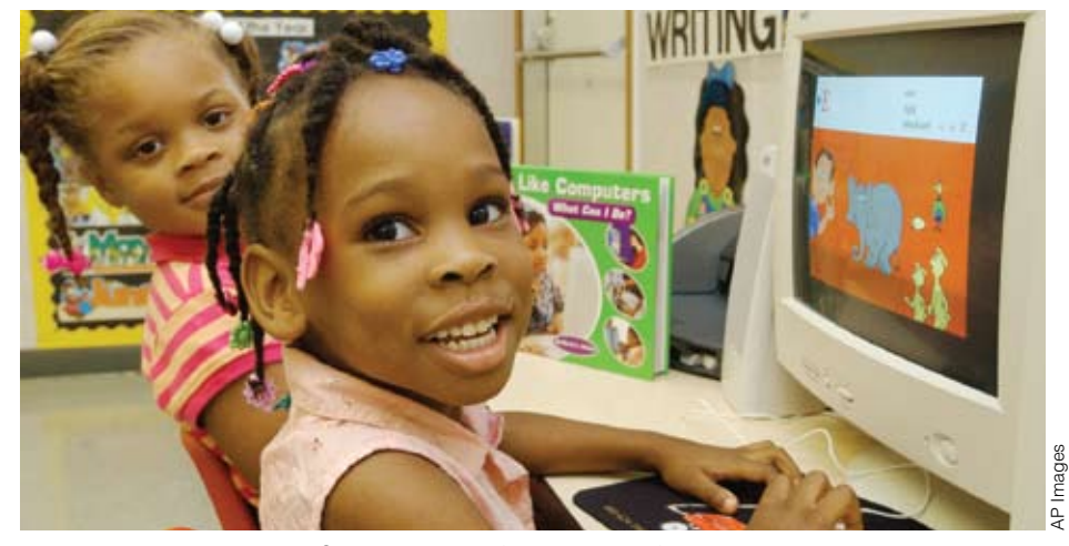
Helping hand: Federal Head Start programs often get kudos for giving children a hand up in learning, but the monetary bureaucratic waste caused by federal involvement in education actually hurts education opportunities.

We have assigned pluses to the "nays" because social-welfare programs are unconstitutional.